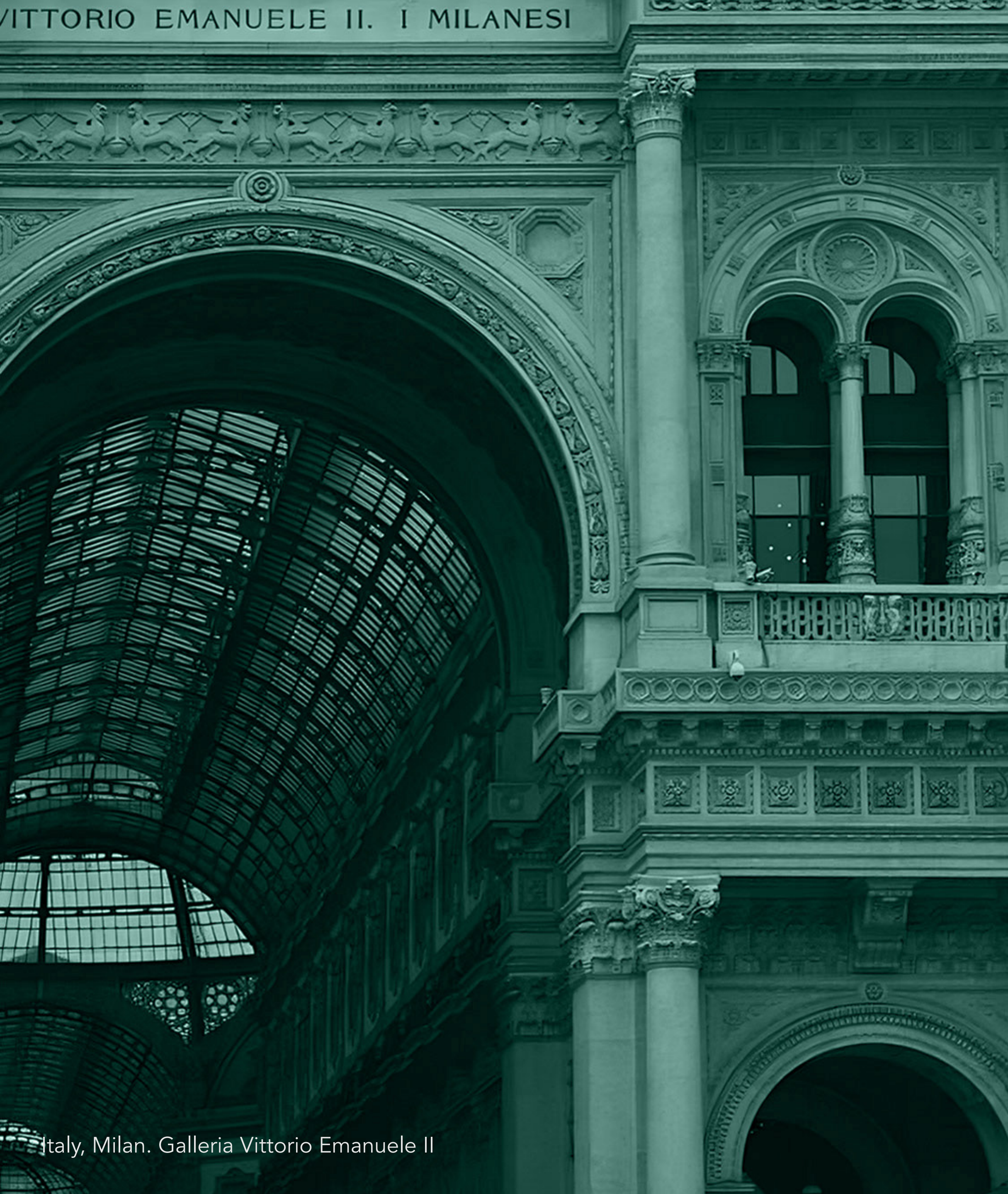
Italy, Milan. Galleria Vittorio Emanuele II